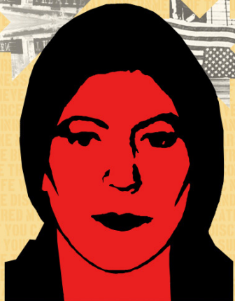
ANNA MAE PICTOU AQUASH INDIGENOUS WARRIOR 1945-1975

It surveys the impact of westward expansion and cultural changes brought about by the Civil War, forced education, intermarriage, the Dawes Act, the New Deal, the World Wars, termination, relocation and stereotypical literature and movies.