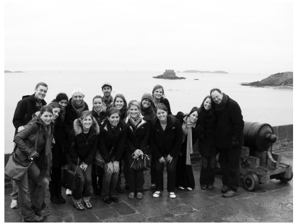
Students on Omaha Beach

In my Western Civilization course, discussions frequently turned to the presidential race. During a particu-